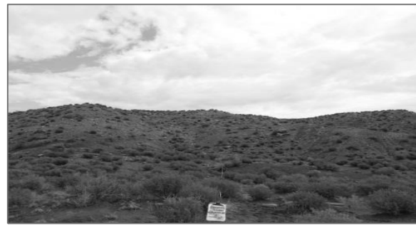
Left: AIM Soil Pit located on a Big Sage Brush LANDFIRE-BPS site. Right: AIM transect located on a Blackbrush LANDFIRE-BPS site.

Range Improvements: The range program works closely with grazing permittees, as well as the general public, to maintain infrastructure and provide for proper management of the livestock grazing program. Several projects completed in 2016 demonstrate the commitment by grazing permittees and the public to the sustainable management of livestock grazing on GSENM. This includes maintenance and repair of existing improvements such as livestock water developments, corrals and fences. Depending on the type of improvement, BLM and the grazing permittees may coordinate their efforts to accomplish these projects. This year maintenance on several important livestock water developments was completed including Cave spring, Calf Pasture Spring, Rock Seep, and Coombs Seep. Deteriorating metal tanks were replaced with low profile recycled/repurposed tire tanks that are highly durable and have a lower profile, making water more accessible for young livestock and smaller species of wildlife.