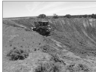
Right: Telegraph Flat 1 during excavation.

installed in a gully that drains an intermittent stream to Clay Hole Wash. The Telegraph Flat 2 and 3 structures were functioning but full of sediment. The dam had been breached and blown out at the Telegraph Flat 4 structure and was in need of repair. In addition, the Telegraph Flat 4 retention pond was full of sediment. Telegraph Flat 2-4 were previously cleaned out in 2012 but have since filled in with sediment. Sediment was removed from the three ponds and used to reinforce the dam structures. The blown out dam at Telegraph 4 was also repaired. During the current cleaning we estimated that approximately 5,051 yd 3 of salt-laden sediment was removed