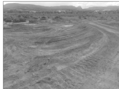
Right: Telegraph Flat 4 after maintenance.

The Finn Little Salinity Control Structure is a gully plug located on Finn Little Wash. The structure has not been maintained for many years and the pond was filled with sediment and the dam was blown through. Sediment was cleaned from the pond and used to reinforce the dam structure and repair the blown out portion of the dam. During the current cleaning we estimated that approximately 3,129 yd 3 of salt-laden sediment was removed. The total salt retained prior to the dam being breached was approximately 209 tons, however we were not able to estimate the annual load since the last cleanout date is unknown.