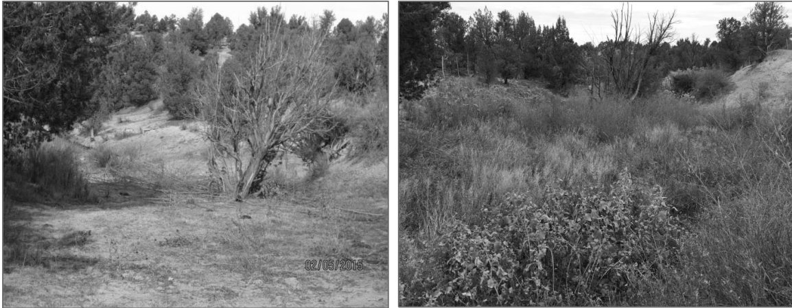
Left: Center Knoll Spring riparian area during protection fence construction. Right: Center Knoll Spring riparian area approximately 1.5 years later .

Several fencing projects were also completed this year, including the Center Knoll spring protection fence and water development. This approximately 2 acre enclosure provides protection to sensitive riparian habitat while providing off site water for grazing livestock.