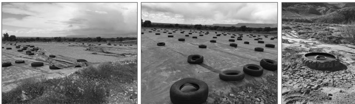
Left: Five Mile catchment apron before repair. Center: Five Mile apron after repair. Right: New tire trough replacing an old trough at Coyote Wash.

Wildlife, range, and fire staff also joined forces to complete numerous water projects during 2016. Staff repaired major damage to several water catchment aprons. These aprons collect precipitation and flow it into large water tanks which store it for future use by wildlife and livestock. These catchments are essential for wildlife and livestock distribution and aid in maintaining a healthy rangeland. Staff replaced a water trough in the Coyote Wash area that receives substantial use by pronghorn. Approximately 4 miles of pipeline was replaced on West Clark Bench. This pipeline sustains water for three troughs which helps distribute livestock and wildlife. Water storage capacity was increased at the Timber Mountain catchment by adding an additional water storage tank. The catchment apron and wildlife watering drinker at Timber Mountain were also repaired to a functional condition.