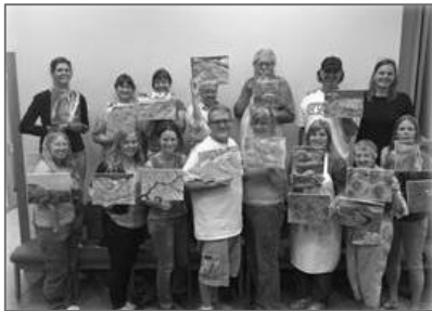
Artist-in-Residence Workshop participants show off artwork in Escalante, Utah,

Junior Ranger Program: The Junior Ranger Program targets children six through twelve years old, and provides parents and children a fun and educational way to enhance their experience on public lands. Discovery Backpacks contain equipment, supplies, and information on how to perform rudimentary experiments and identify specimens using scientific methodology. Parents may check out and return a backpack to any of the four GSENM visitor centers without charge. For those children not able to take advantage of the Discovery Backpacks, a Junior Scientist Booklet is available at visitor centers free of charge. The booklet offers children fun activities, highlighting visitor center interpretive exhibits and the scientific process. GSENM issued 1000 badges to youth who completed the activity guide for the Junior (Scientist) Explorer program.