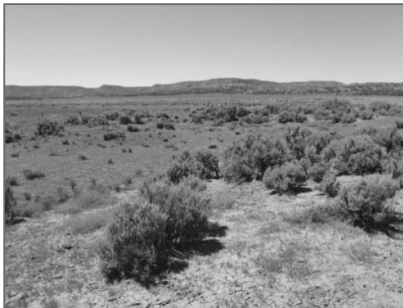
Left: Telegraph Flat 1 before excavation.

Telegraph Flat 2, 3, and 4 consist of three consecutive gully plug salinity control structures