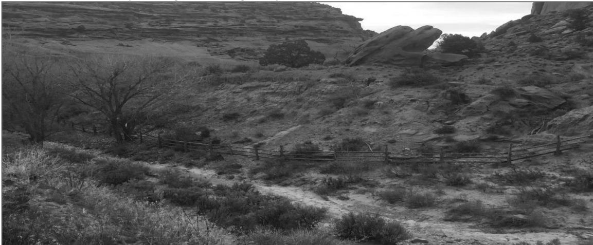
Long Canyon Stock Driveway Drift Fence

Also the Long Canyon stock driveway drift fence replaced a series of wire and brush stop gaps with a more functional and aesthetically pleasing structure that also aids ranchers in moving cattle more efficiently through the Long Canyon area of the Burr trail.