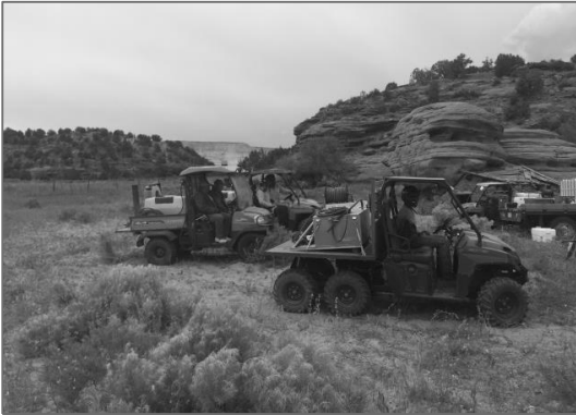
Left: Spraying Scotch Thistle at Nipple Lake.

Weed Program: The GSENM has an active weed management program. Scotch Thistle, Knapweed, Whitetop, Russian Olive and Tamarisk are our biggest threats. Each year we try to focus on the known populations and inventory for any new ones. We are involved in the local Cooperative Weed Management Area and commit substantial time throughout the weed season assisting on these communal spray projects. As shown below we helped the Zion National Park spray Silver Nightshade which is an invasive plant that has become a threat to native plants in the area.