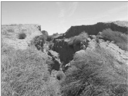
Left: Telegraph Flat 4 gully before repair.