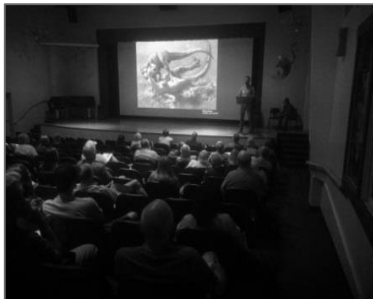
Science Symposium participants enjoy presentation on paleontology as part of the GSENM 20 th Anniversary Science Symposium in Escalante.

Science Symposium: As part of its 20 th Anniversary Celebration, GSENM sponsored a Science Symposium, located in Kanab and Escalante, Utah and featuring 26 lectures and fieldtrips given by prominent scientists from around the country. Drawing 309 participants, these educational presentations highlighted GSENM research, discoveries, and accomplishments. In addition, GSENM created a Science Report publication and DVD containing summaries of research conducted on GSENM over the last 10 years. A copy of the Science Report may be downloaded from the Grand Staircase Escalante Partners website at: www.gsenm.org .