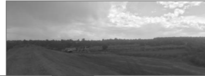
Right: Telegraph Flat 2