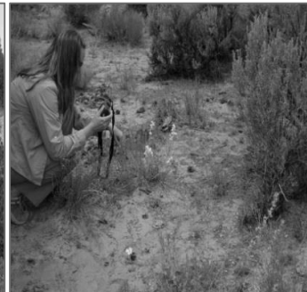
Left: Carmin gilia Center: Crew from the Chicago Botanic Garden Right: Inventory and seed collection

Eightmile Salinity Control Project: Monument staff have engaged over the past three years to restore Eightmile Pond, a large salinity collection structure. Several similar structures across the monument collect highly saline soils and keep them from entering the Colorado River system. Phase 1 (2013) included site stabilization work, including spillway reconstruction, spillway restoration and spreader dike construction in preparation for major site work performed in FY14. Phase 2 (2014) began capacity restoration to the impoundment reservoir. Over 60,000 cubic yards of saline material was removed from the reservoir and impounded on site. Work in 2015 finalized the impoundment area and sediment retention; much of the pond was functioning to retain soils and water.