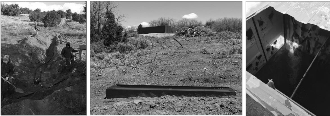
Left: Staff replacing valves on the West Clark pipeline. Center: Newly replaced wildlife drinker in foreground and water storage tank in background at Timber Mountain. Right: Rain water flowing into the new tank at Timber Mountain.

Monument wildlife staff completed additional inventory on reptiles and amphibians in 2016. Seventeen different reptile and amphibian species were recorded. Christmas bird counts were conducted in Escalante, Kanab and Boulder. One of the highlights of the counts was the appearance of flocks of Lewis' woodpeckers. GSENM wildlife staff also assisted the Utah Department of Wildlife Resources with midwinter bald eagle surveys, the annual bat blitz, peregrine surveys, Colorado cutthroat trout spawning and winter bird surveys.