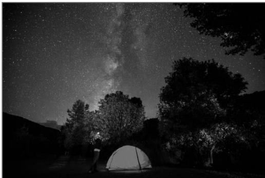
Night sky over Escalante Canyons

Dark Skies Research: In the spring of 2016, a research team from Weber State University and the International Dark Sky Association operating under a Monument Science permit collected baseline night sky quality measurements using hand-held sky quality meters that were calibrated with satellite images at 12 different locations within GSENM. Analysis of the results indicates that not only is the