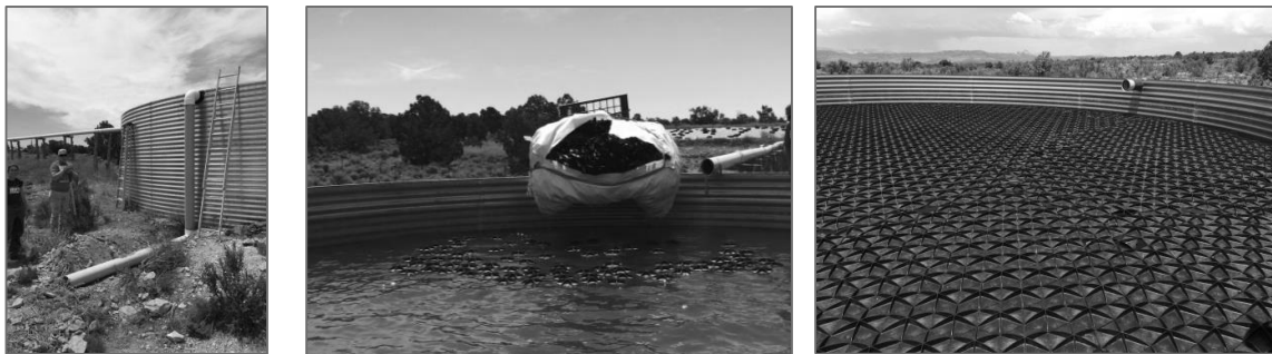
Left: Seasonal range and fire staff assist in construction of overflows. Center: Hexa-cover discs being added to a large storage tank. Right: The floating discs are beginning to interlock to form a semi-solid lid. These lids reduce evaporation by 95% and reduce wildlife mortality.

Wildlife, range, and fire staff also joined forces to complete numerous water projects during 2016. Staff repaired major damage to several water catchment aprons. These aprons collect precipitation and flow it into large water tanks which store it for future use by wildlife and livestock. These catchments are essential for wildlife and livestock distribution and aid in maintaining a healthy rangeland. Staff replaced a water trough in the Coyote Wash area that receives substantial use by pronghorn. Approximately 4 miles of pipeline was replaced on West Clark Bench. This pipeline sustains water for three troughs which helps distribute livestock and wildlife. Water storage capacity was increased at the Timber Mountain catchment by adding an additional water storage tank. The catchment apron and wildlife watering drinker at Timber Mountain were also repaired to a functional condition.