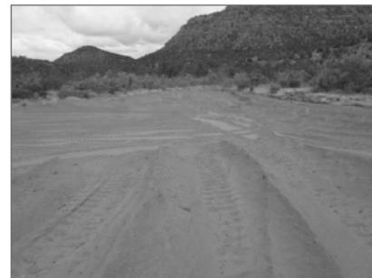
Right: Finn Little salinity control structure after repair.