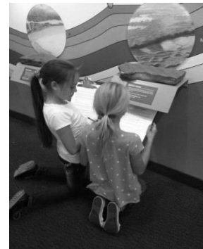
Students participate in an Every-Kid-in-Park information scavenger hunt at the GSENM Kanab Visitor Center

GSENM provided educational events for 2,529 regional youth (including 1719 fourth graders as part of the Every-Kid-in-Park program). In working with educators in the development of lesson plans, the BLM insures that activities meet educator expectations and needs, and Utah and Arizona curriculum standards. At the same time, this collaboration allows GSEP and BLM to build mutually beneficial relationships with educators and their students grounded within a solid foundation of public land stewardship. As a result, BLM is better able to communicate and recruit participants for progressively more engaging land management opportunities to a wider and more receptive audience.