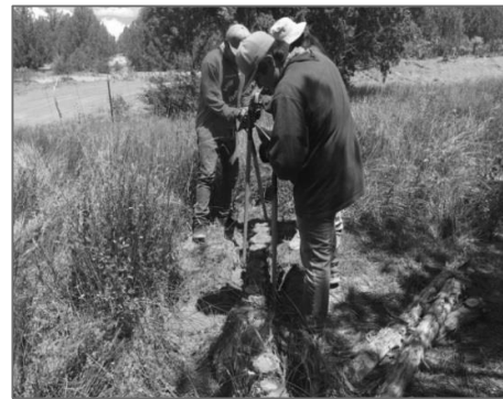
Installation of a sediment collection structure at Old Corral Spring to control erosion and rebuild the system.

Riparian Restoration: There are many riparian systems throughout the GSENM all of which are managed to restore the functionality of a riparian system. For the past several years we have focused a lot of our time on one in particular, Old Corral Spring. This project is more than just a spring restoration project it's a Native American Native Plant Restoration Project and is an on-going Hands-on-the-Land Youth project.