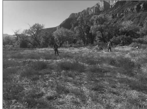
Right: Canyon Country Weed Management Area spray day in Zion National Park.

Hummingbird and Bat Studies: The Monument continued long-term studies of bats and hummingbirds. During 2016 GSENM monitored bats in locations ranging from just over 4,000 feet elevation to 10,000 feet, which resulted in catching 12 out of the 18 known species from Utah. The Monument also hosted an acoustic bat detection training session that was attended by bat enthusiasts and biologists from across the West.