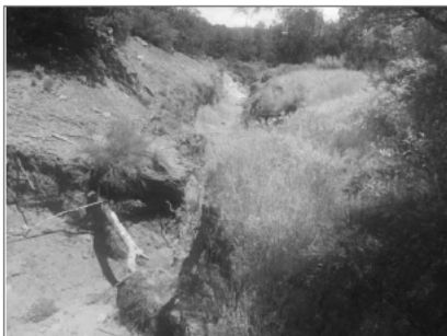
Left: Finn Little gully before repair.

The Finn Little Salinity Control Structure is a gully plug located on Finn Little Wash. The structure has not been maintained for many years and the pond was filled with sediment and the dam was blown through. Sediment was cleaned from the pond and used to reinforce the dam structure and repair the blown out portion of the dam. During the current cleaning we estimated that approximately 3,129 yd 3 of salt-laden sediment was removed. The total salt retained prior to the dam being breached was approximately 209 tons, however we were not able to estimate the annual load since the last cleanout date is unknown.