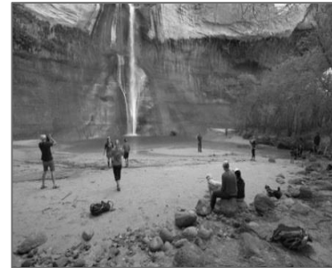
Participants of the special GSENM 20 th Anniversary Respect & Protect National Public Lands Day Event at Lower Calf Creek Falls.

In celebration of GSENM's 20th Anniversary, GSENM in cooperation with Kanab Field Office, Grand Staircase Escalante Partners (GSENM), and Glen Canyon Natural History Association (GCNHA), sponsored 96 celebration events, presentations, field-trips, demonstrations, exhibit, commemorative items, publications, parade entries, press releases, and website stories. Included in these opportunities were birthday celebrations in each of our visitor centers held on September 18, 2016; and a special Respect & Protect National Public Land Days Event at Calf Creek Recreation Area. Overall, 2,948 people participated in the GSENM 20th Anniversary Special Events.