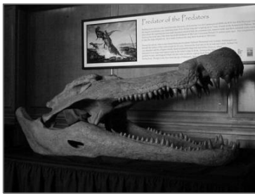
Featuring a five-foot reconstructed Deinonychus hatcheri skull, GSENM loaned the Department of Interior one of their Traveling Exhibits for display at the Main Interior Building in Washington DC.,

Interpretive Media: In fiscal year 2016, GSENM updated two interpretive and visitor service publications. GSENM printed 55,000 copies of the Visitor Information Brochure and 35,000 copies of the Calf Creek Guide.