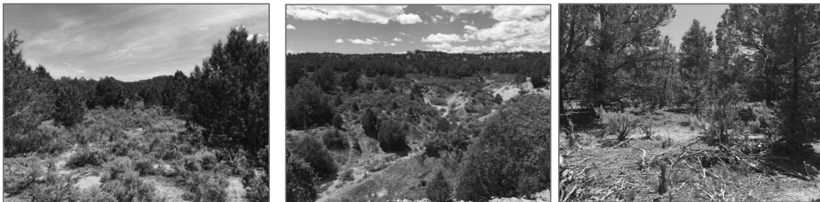
Left: Phase I pinyon/juniper encroachment. Center: Tree encroachment and subsequent habitat decline led to accelerated erosion and gully formation. Right: Phase III tree encroachment - sagebrush understory is nearly completely absent

Greater Sage-Grouse Habitat Assessment: Monument wildlife staff completed an ocular assessment of greater sage-grouse habitat on the Monument in the summer of 2016. Nearly 30,000 acres were assessed on foot and horseback to determine the current condition of our sage-grouse habitat. The Monument management plan was amended in September 2015 to include protections for sage-grouse and their habitat. In our area, encroachment of pinyon and Utah juniper trees is a major cause for concern as it leads to a decline in sage-grouse habitat condition.