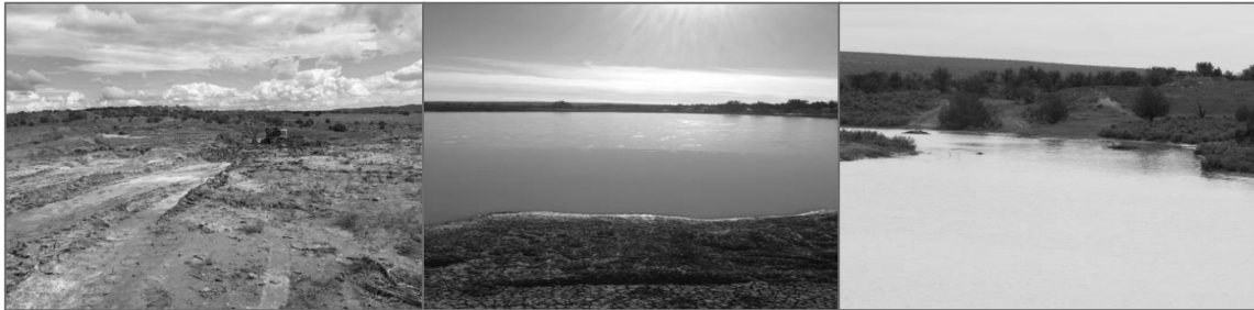
Left: Removal of saline sediment from the north reservoir. Center: Eightmile Reservoir filled to capacity after 2015 monsoonal moisture. Right: Eightmile Reservoir with impounded saline soil captured in the background.

In 2016 the Eight Mile Salinity Control Structure collected sediment and water during the summer 2015 monsoon rains. As of July 1, 2016 the pond was inundated with water so it was not possible to measure the depth of sediment that accumulated during the previous year. However, based on a 40 year average of 0.4 feet of sediment retention per year the estimated salt reduction was approximately 28.7 tons in 2016.