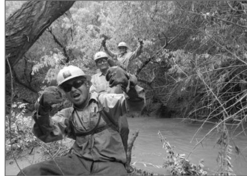
SWCC Ancestral Lands Program

Grand Staircase-Escalante Partners (GSEP) functions in an important role within the partnership by coordinating private funding and by providing guidance to the conservation corps supporting the project. GSEP obtained in grants from entities such as the Walton Family Foundation, Utah Partners for Conservation and Development (UT-DNR), as well as other private foundations and organizations. GSEP also provided two employees and worked with an Americorp intern to provide field support for each crew, as they did retreatment in both GSENM and Glen Canyon National Recreation Area. Three conservation corps participated in the this year's work, Utah Conservation Corps (16 youth) Canyon Country Youth Corp (16 youth), Southwest Conservation Corp (SWCC) - Ancestral Lands Program (5 youth). The Great Old Broads for Wilderness also provided a crew 12 people who gained experience in woody invasive removal in 2016.