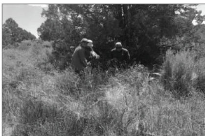
Paiute Youth Conservation Corps (YCC) crew working on experimental planting bed as part of on-going Native Plant Restoration

In continuation of the Title I Native American, Underserved, & Rural Disadvantaged Youth Engagement, Education, & Employment Program, interns provided by Southern Utah University IIC disseminated federal career recruitment information for diversity students, created by program sponsored Native American interns in 2015.